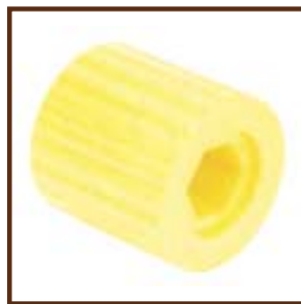
AA45605 Low Meter Roller For low rates from 1 to 20 lb/acre.