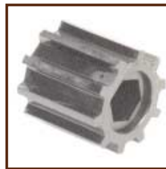
AA45606 Regular Meter Roller For rates from 20 to 130 lb/acre.